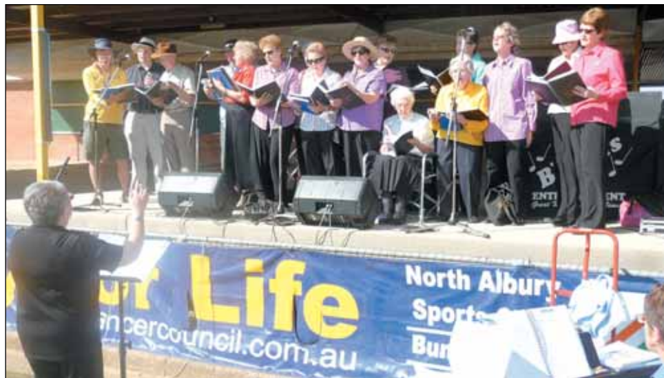
• Sing Australia Albury-Wodonga perform at Relay for Life

On Sunday celebrations will continue at the Seventh Day Adventist Community Hall, Corner Melrose and Roadshow Drive, Wodonga.